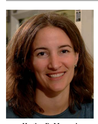
Heather D. Maynard

Initially, PEG was synthesized by reacting mPEG (monomethoxy-PEG) of molecular weight (M_w) 5000 with cyanuric chloride, forming PEG dichlorotriazine. In this approach, one of the two remaining chlorines on PEG dichlorotriazine is displaced by nucleophilic amino acid units such as lysine, serine, tyrosine,