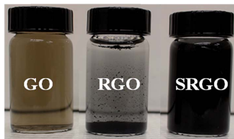
Fig. 1 Optical images of GO, RGO and SRGO dispersed in water at the concentration of 0.5 mg \text{mL}^{-1} .