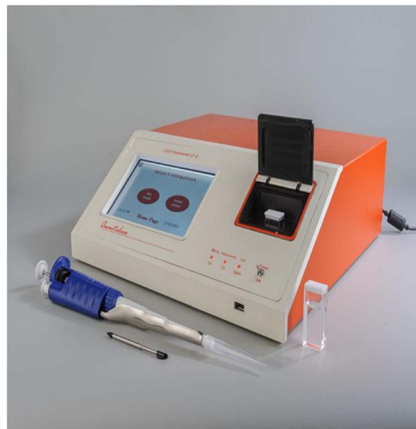
Fig. 2 LED fluorimeter (model LF-2) (Quantalase, India).

Humic substances are complex and heterogeneous mixtures of polydisperse materials formed in soils, sediments, and natural waters by biochemical and chemical reactions during the decay and transformation of plant and microbial remains (a process called humification). Thus, humic substances are a fraction of natural organic matter and are involved in many processes in soils and natural waters: e.g. , soil weathering, plant nutrition, pH buffering, trace metal mobility and toxicity, bioavailability, degradation and transport of hydrophobic organic chemicals, formation of disinfection by-products during water treatment, and heterotrophic production in black water ecosystems. 45 Organic material, especially humic acids (HA) and fulvic acids (FA), also play an important role because of the complexation as well as the sorption processes. 46,47 As stated and observed by Riggle and Wandruszka in their work on the stability of uranium(vi) complexes of humates and fulvates in biphasic systems, slight momentary heating of aqueous solutions (by \sim 10^\circ\text{C} ), containing humic substances (HSs) and uranyl ions