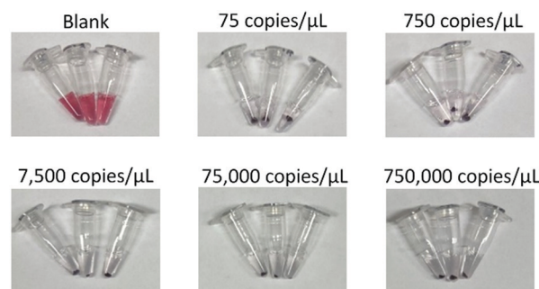
Fig. 3 Representative images from triplicate analysis of samples containing varying concentrations of the SARS-CoV-2 viral RNA. The N gene was detected. 5 μL of the viral RNA sample was used. The tubes labelled blank contained all reagents but no RNA sample (negative control).

sufficient for RT-LAMP to amplify low copies of the viral RNA. We then used the CRISPR/Cas12a-mediated AuNP aggregation assay to test these solutions (Fig. 3). The color of the negative control solution that contained all the reagents but no viral RNA remained red, whereas the color of all positive sample solutions changed from red to purple and then to nearly colorless after centrifugation for 10 s. Aggregated AuNP pellets