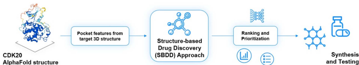
Fig. 3 Insilico Medicine generative procedures for CDK20 hits.

After uploading a protein structure to the Chemistry42 platform, the built-in energy-based approach is automatically used in order to determine putative binding sites. The surface of the protein is evenly covered with probes (methyl), and the energy of non-covalent interactions with the receptor atoms is calculated for each probe. Probes having energy lower than a user-defined threshold are clustered into separate pockets. Each identified cavity is scored using pocket volume, surface, and depth descriptors. Based on these descriptors, Chemistry42 provides a list of identified binding sites.