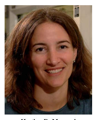
Heather D. Maynard

Initially, PEG was synthesized by reacting mPEG (monomethoxy-PEG) of molecular weight (M_w) 5000 with cyanuric chloride, forming PEG dichlorotriazine. In this approach, one of the two remaining chlorines on PEG dichlorotriazine is displaced by nucleophilic amino acid units such as lysine, serine, tyrosine,