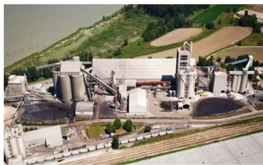
Cement -Lehigh Hanson Materials Ltd. (Delta) t CO 2 e = 873,630 in 2018 report Table 2