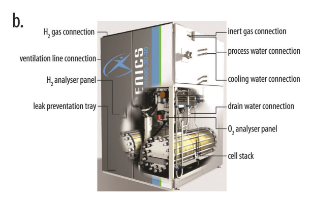
Fig. 1 (a) A schematic illustration of a simple U-tube configuration for water electrolysis. Voltage penalties (overpotentials) increase the total voltage required to operate the system at a given rate relative to the thermodynamically required potential, and include the kinetic overpotentials associated with the hydrogen-evolution and oxygen-evolution reactions (\eta_{\text{HER}} \text{ and } \eta_{\text{OER}}, \text{ respectively}), \text{ the concentration overpotential } (\eta_{\text{con}}), \text{ and } ohmic resistance loss ( \eta_{\text{ohm}} ). The total operating voltage of the system is given by the sum of the thermodynamic voltage for the water-splitting reaction and the total overpotential, \eta_{\text{total}} , for the system. (b) A schematic illustration of a commercially available (Hydrogenics) alkaline water electrolyzer with auxiliary components.7

\eta_{\text{total}} = \eta_{\text{HER}} + \eta_{\text{OER}} + \eta_{\text{ohm}} + \eta_{\text{con}}