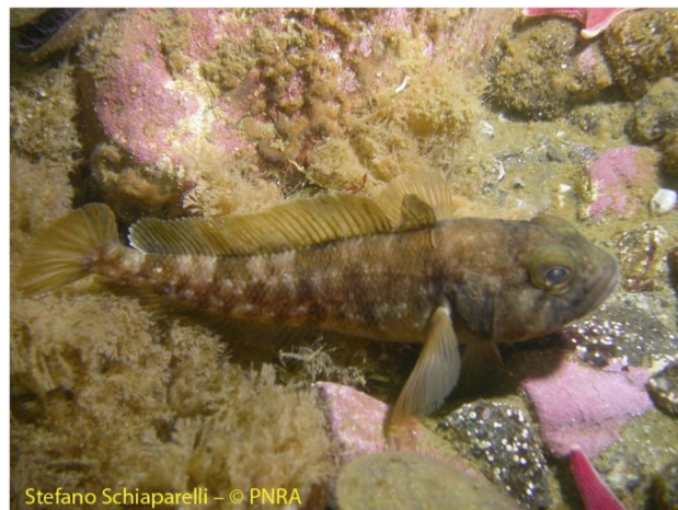
Fig. 3 A specimens of Trematomus bernacchi.

In order to compare with and complement observations in the Arctic, the following discussion focuses on POP temporal trends in marine fish and Adélie penguins. These species are native to Antarctic marine environment and thus suitable to study temporal changes in contaminant exposure in this region. The Tables 1–4 report the concentrations of POPs in the most studied fish and penguin species. Among POPs, we selected PCBs, p,p' -DDT, p,p' -DDE, DDTs, and HCB since other chemicals, including emergent contaminants, were reported only in few articles.