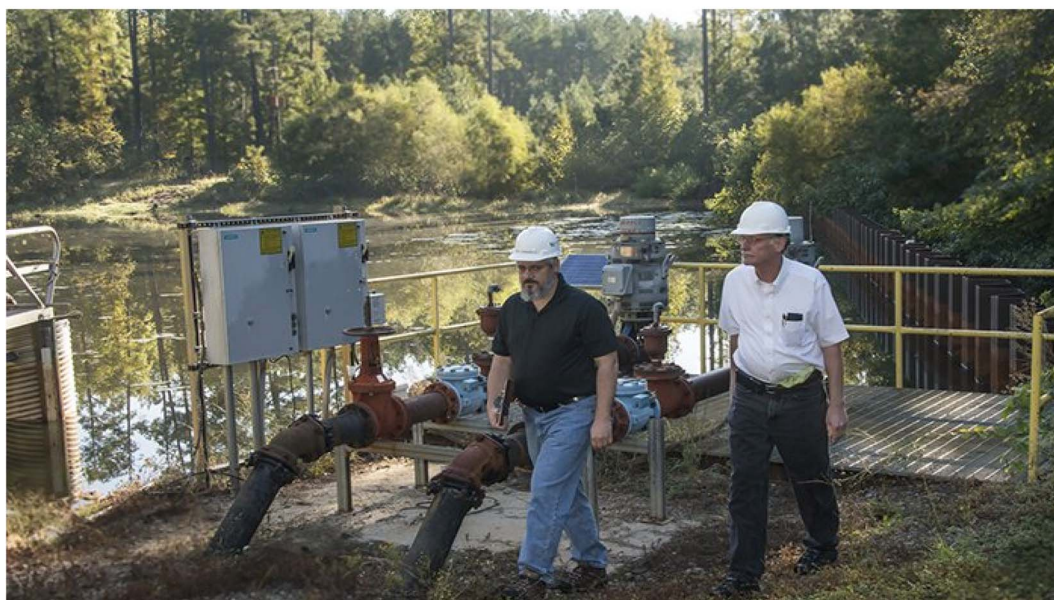
Fig. 3 Top – Sub-processes of phytoremediation, showing phytovolatilization, phytoextraction, rhizofiltration and phytostabilization. 3 H is released into the environment through the former-most option, diffusing into the atmosphere through leaves rather than being expelled by the roots. Bottom – Photo from DOE 112 showing Savannah River Nuclear Solutions engineers examining pumping equipment next to the 3 H-contaminated groundwater storage pond. Water is pumped from the pond and used to irrigate the surrounding woodland, where evaporation and phytovolatilization release 3 H into the atmosphere.