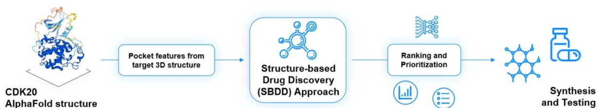
Fig. 3 In silico Medicine generative procedures for CDK20 hits.

After uploading a protein structure to the Chemistry42 platform, the built-in energy-based approach is automatically used in order to determine putative binding sites. The surface of the protein is evenly covered with probes (methyl), and the energy of non-covalent interactions with the receptor atoms is calculated for each probe. Probes having energy lower than a user-defined threshold are clustered into separate pockets. Each identified cavity is scored using pocket volume, surface, and depth descriptors. Based on these descriptors, Chemistry42 provides a list of identified binding sites.