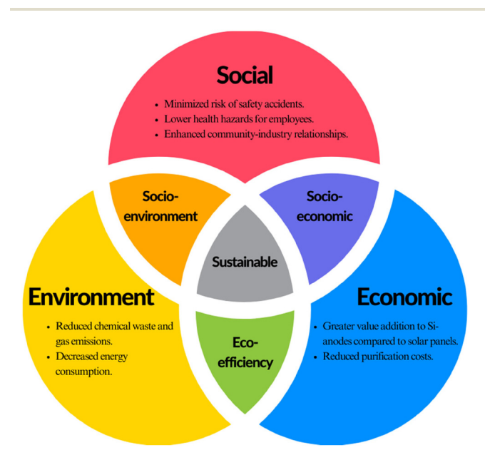
Fig. 3 Triple bottom line assessment Venn diagram.

Recovered silicon from used solar panels offers multifaceted environmental advantages. Firstly, the ultrahigh capacity of Si significantly boosts the LIB performance, especially in terms of energy density. This indirectly contributes to the proliferation of renewable energy storage solutions, reducing the