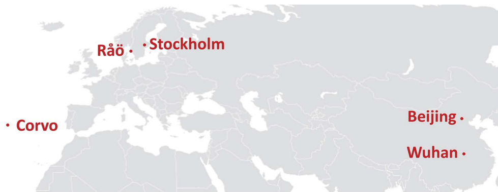
Fig. 1 Map showing the sample sites.

Shanghai (about 690 km from Wuhan). We are not aware of any fluoropolymer plant located closer to the sampling sites. While Wuhan is a site which may be influenced by industrial point sources, Beijing was chosen to represent an urban background environment in a source region. Two sites receiving input from sea spray were included in the study: Råö and Corvo. Corvo is the smallest and the northernmost island of the Azores archipelago, located in the North Atlantic Ocean, 3700 km east of Portugal. The island has approximately 450 inhabitants. Råö is a rural island on the Swedish west coast. Råö is used as a background station in the Swedish environmental monitoring program, but is not considered a remote site as it receives air masses from the European continent. Samples were also taken in Stockholm, a site selected to represent an urban European site. Metropolitan Stockholm has 2 270 000 inhabitants and is located on the Baltic Sea coast. Large-scale manufacturing of PFAAs has not occurred in Scandinavia. Therefore, none of the European sites are expected to be influenced by direct industrial emissions.