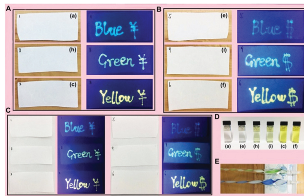
Fig. 4 Fluorescence intensity changes upon changes in temperature and solvents. (A) Application of DSA-G ⊂ H1-4C4P (a, h, c) and (B) DSA-G ⊂ H2-2C4P (e, i, f) written on filter paper, (left: under natural light, right: under ultraviolet light, \lambda_{em} = 365 nm) as tunable fluorescent inks. (C) Fluorescent inks of DSA-G ⊂ H1-4C4P (a, h, c) and DSA-G ⊂ H2-2C4P (e, i, f) on the same white paper; (a: H1-4C4P ([ H1-4C4P ] = 50 \mu M); h: DSA-G ⊂ H1-4C4P ([ H1-4C4P ] = 50 \mu M, [ DSA-G ] = 10 \mu M); c: DSA-G ⊂ H1-4C4P ([ H1-4C4P ] = 50 \mu M, [ DSA-G ] = 100 \mu M); e: H2-2C4P ([ H2-4C4P ] = 50 \mu M); i: DSA-G ⊂ H2-2C4P ([ H2-2C4P ] = 50 \mu M, [ DSA-G ] = 10 \mu M); f: DSA-G ⊂ H2-2C4P ([ H2-2C4P ] = 50 \mu M, [ DSA-G ] = 100 \mu M)). Images of (D) the solutions and (E) solution-loaded pens.

spectra (Fig. S31 and S32, ESI † ) of DSA-G ⊂ H1-4C4P and DSA-G ⊂ H2-2C4P indicated the changes of their diffusion coefficients. Compared with individual DSA-G with the diffusion coefficient of (2.87 \pm 0.08) \times 10^{-9} \text{ m}^2 \text{ s}^{-1} , the diffusion coefficient decreased upon addition of H1-4C4P or H2-2C4P , suggesting that they gradually assembled into large polymeric architectures.