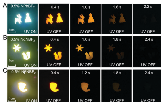
Fig. 2 Photographs of (A) NPhBF 2 –MeOBP-0.5%, (B) NαNBF 2 –MeOBP-0.5% and (C) NβNBF 2 –MeOBP-0.5% afterglow materials under 365 nm UV light and after removal of the UV light.