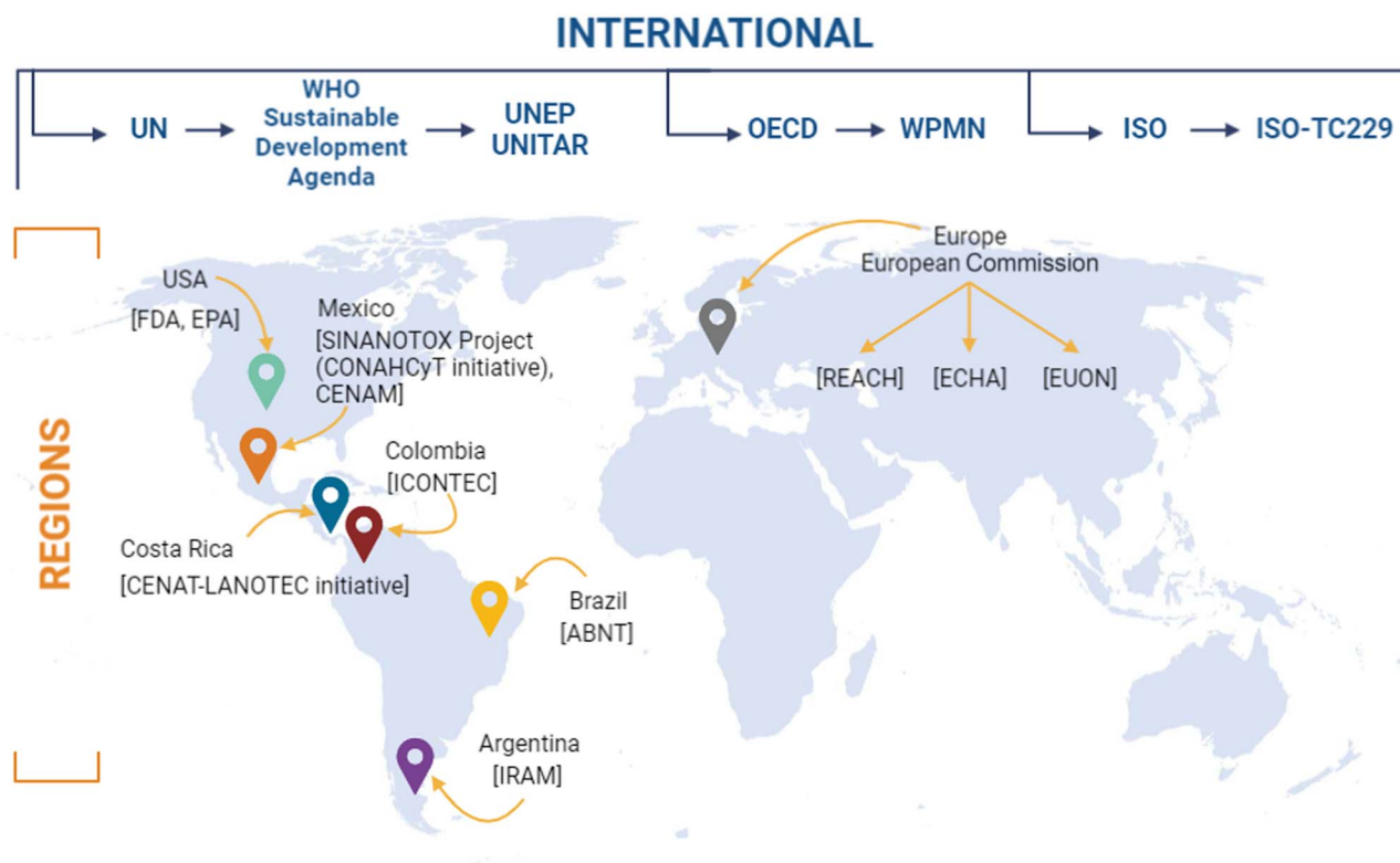
Fig. 4 National and international authorities, agencies and initiatives developing frameworks, legislations, and guidelines for nanomaterials. UN, United Nations; WHO, World Health Organisation; UNEP, United Nations Environment Program; UNITAR, United Nations Institute for Training and Research; OECD, Organisation for Economic Cooperation and Development; WPMN, Working Party on Manufactured Nanomaterials; ISO, International Organisation for Standardisation; ISO-TC229, International Organisation for Standardisation Technical Committee 229; USA, United States of America; FDA, Food and Drug Administration; EPA, Environmental Protection Agency; SINANOTOX, National Nanotoxicological Evaluation System Initiative; CONAHCyT, National Council of Humanities, Sciences and Technologies; CENAM, National Centre of Metrology; CENAT, National Centre of High Technology; LANOTEC, National Laboratory of Nanotechnology; ICONTEC, Colombian Institute of Technical Norms; ABNT, Brazilian Association of Technical Norms; IRAM, Argentinian Institute of Normalisation and Certification; REACH, Registration, Evaluation, Authorisation, and Restriction Chemicals; ECHA, European Chemical Agency; EUON, European Union Observatory for Nanomaterials. Original creation (using Excel and Biorender programs) based on information obtained from ref. 12, 31, 79–81, 94, 98, 115, 124–137, 143, 144, 159, 180, 189, 202–204, 269.

The momentum of nanotechnology development, establishment, and consolidation paths varies and differs between