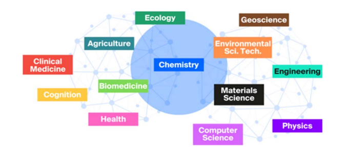
Fig. 1 Chemistry is usually depicted as "the central science". This simplified scheme depicts how chemistry is connected to many other fields based on the connectivity maps generated from bibliographical analyses (adapted from Rafols, Porter, and Leydesdorff, 2010).<sup>6</sup>

aromaticity.7 These results challenged the previous belief that carbon-carbon covalent bonds are immutable, opening doors to dynamic systems with interesting possibilities in the design of sustainable solutions, such as systems that actively adapt to the environment around them. Additionally, some of these molecules and materials could exhibit different behaviours based on external stimuli, "smart systems" with great potential in applications such as medicinal chemistry.8 Other opportunities include the design of molecules with features like sustainability already built-in chemists could create connections and design efficient "disconnections" that ensure efficient degradation to the original building blocks for recycling and upcycling.9 Similarly, organocatalysis (selected within the first IUPAC Top Ten list in 2019) is realising the potential of non-metallic compounds to catalyse enantioselective transformations efficiently and sustainably,10 supported by the award of the 2021 Nobel Prize in Chemistry to David MacMillan and Benjamin List. Currently, our chemical technologies transform only one-third of all raw materials into useful products - therefore, the vast majority is wasted. 11 New discoveries, such as dynamic bonds, could expand the toolbox of adaptive chemistry, a strategy that explores the potential of responsive materials to yield fascinating features such as self-