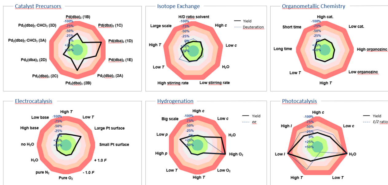
Fig. 2 Examples showcasing sensitivity screens tailored to diverse research fields. 13–16 In instances like hydrogenation, isotope exchange and photocatalysis the sensitivity screen was utilised to illustrate two target values, such as yield/deuterium incorporation, yield/enantiomeric excess and yield/ E:Z ratio, along with the parameters' impact on them.

Our innovation was embraced by the scientific community and has since been widely adopted for applications beyond the originally suggested ones. Originating from a background in photochemistry, we initially considered only yield as the target value and parameters such as: temperature, concentration, oxygen and moisture levels, light intensity, and scale. The use of the sensitivity screen within the scientific community, including our own group, has led to its adoption modified with additional parameters and target values. While the target value was formerly only yield, researchers have suggested and applied conversion, product ratio, selectivity, ee, throughput, TON, radiochemical yield (RCY), molar/specific activity ( A_m/A_s ), H/D -ratio, purity, space-time yield and enzyme activity, 12 and the standardisation of these terms has been a central achievement of the chemical community (Fig. 2). 13–16 Especially for industrial processes with more than one desired product, the reaction can be steered towards a customised product distribution, which might alter given the demand of the chemical product. A radar