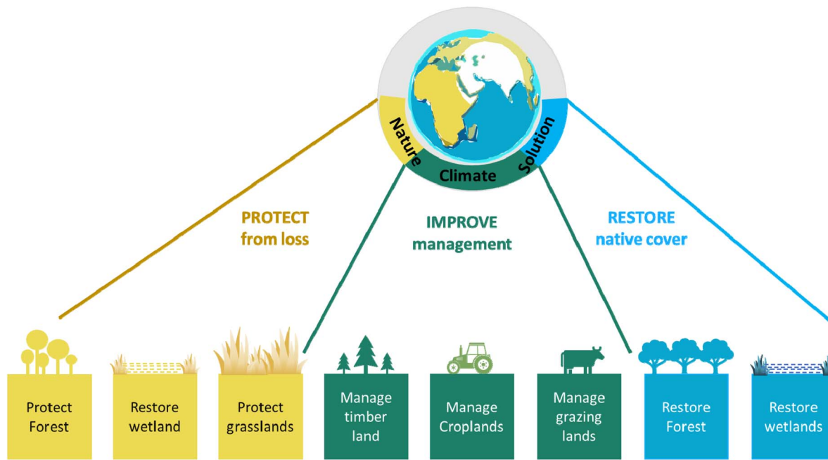
Fig. 3 Nature climate solutions for mitigating climate change through the carbon farming approach.

change due to their capacity to sequester a substantial amount of carbon dioxide, totaling 14.07 gigatons, in the form of “blue carbon” within the coastal sediments. 50 Adopting reforestation, sustainable forest management, and agroforestry practices can significantly enhance global carbon sequestration by harnessing the substantial capacity of trees to store carbon and augment soil carbon levels.