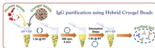
Fig. 24 Use of hybrid alginate-protein cryogel beads to purify IgG (schematic). From ref. 269.

abundant functional groups. 261–268 For instance, Kamaci et al. 264 observed enhanced catalytic activity of immobilized phytase into polyvinyl alcohol-sodium alginate (PVA-SA) electrospun nanofibers. Nanofibers were fabricated by mixing PVA and SA at a 80:20 ratio, voltage of 23 kV, and distance of 14 cm via electrospinning. Sharma et al. 269 prepared bio-based and low-cost hybrid alginate-protein cryogel beads as novel adsorbent materials for the purification of immunoglobulin (Ig)G from human serum (Fig. 24). Due to soft interaction between the protein and IgG, the stability and integrity of the antibody were retained after the desorption step. Similarly,