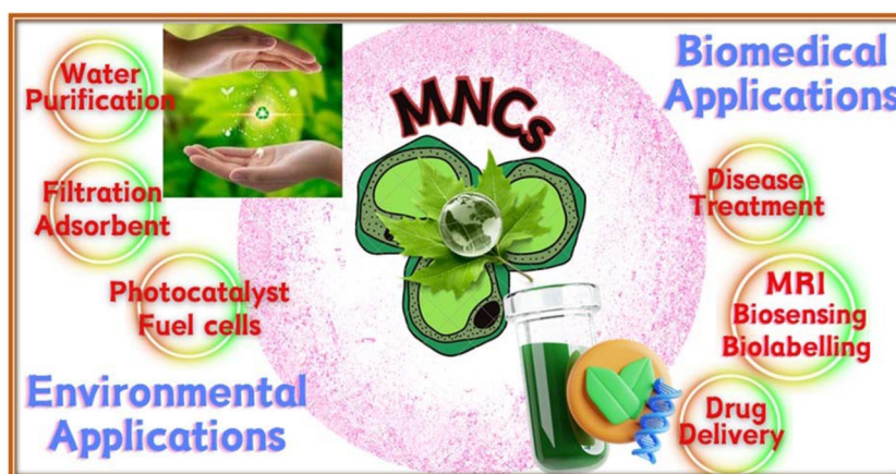
Fig. 3 Schematic presentation showing the various translational applications of magnetic nanocellulose composites (MNCs) in the biomedical and environmental fields.