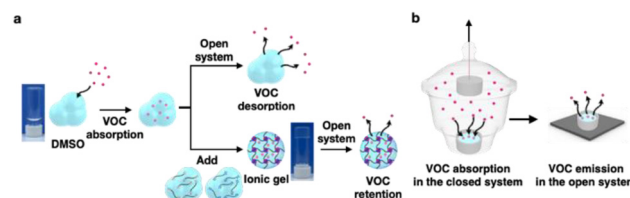
Fig. 5 (a) Mechanism of the absorption and desorption of VOCs from the DMSO and mechanism of the retention of the VOCs through forming an ionic gel. (b) Schematic of experimental conditions in the open system.