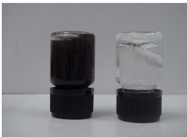
Fig. 1 Photographs of vials containing the pristine BNNTs (right-hand side) and the functionalized BNNTs (left-hand side) in water after standing overnight.

description in the ESI†). To confirm the functionalization and reveal the functionalization mechanism of BNNTs with dopamine, FTIR analysis was conducted on the pristine and functionalized BNNTs.