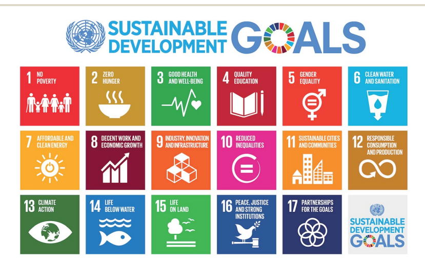
Fig. 1 The 17 SDGs of the UN, aimed at ending poverty, protecting the planet, and ensuring prosperity for all as part of the sustainable development agenda. Each goal has specific targets to be achieved over the period 2015–2030 (http://www.un.org/ sustainabledevelopment/sustainable-development-goals/). An 18<sup>th</sup> SDG aimed at clean air should be added.

It is proposed here to adopt an additional SDG on "clean air", at the same level as good health, clean water, sustainable industrialization and cities, responsible production, climate action, marine and terrestrial life (SDGs 3, 6, 9, 11, 12, 13, 14, 15, respectively), not only because ambient air pollution is the leading environmental risk factor of the global burden of disease,<sup>8</sup> but also because many other SDGs cannot be achieved without considering air quality. The next Section 2 focusses on results from the Faraday Discussion meeting Atmospheric chemistry in the Anthropocene , held in York, UK, from 22–24 May 2017, which presented scientific results that underpin this statement. Section 3 presents an update of the