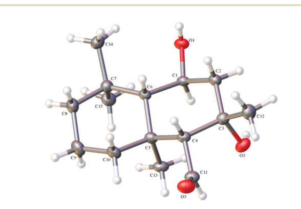
Fig. 1 ORTEP image of aldehyde 21

The synthesis of a (Z)-haloalkene fragment such as 13 began with aromatic nitration of commercially purchased 4-methylacetophenone using HNO<sub>3</sub>/H<sub>2</sub>SO<sub>4</sub> to nitro compound 23 and hydrogenolysis of the nitro group to an aniline intermediate, before diazotisation and in situ hydrolysis finally gave phenol 24.11 O-Protection of 24 as the tert-butyldimethlsilyl ether using TBSCl in the presence of imidazole gave the siloxyacetophenone 25 (Scheme 4). There are scarcely any methods for the halo-olefination of acetophenones. Indeed, the use of standard halogenated Wittig and Horner-Wadsworth-Emmons reagents in combination with a range of bases was initially investigated but this resulted in either the return of starting materials or the observed formation of only traces of suspected alkenes. Of the few known methods for such a transformation we investigated a three-step process firstly reported by Barluenga<sup>12</sup> and later modified by Ando.<sup>13</sup> Treatment of acetophenone 25 with dibromomethyl lithium, formed through deprotonation of CH2Br2 with LiNi-Pr2, facilitated conversion to alcohol 26. The tertiary alcohol of 26 was then protected as the trimethylsilyl ether using TMSCl in the presence