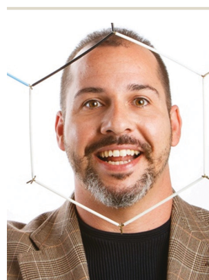
Luis Miguel Azofra

Ellman's sulfinamide represents as an industrially relevant reagent, frequently used as an ammonia surrogate in the synthesis of enantiopure primary amines. 11 This transformation typically requires three chemical steps, i.e. , stoichiometric