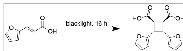
Fig. 1 Scheme of CBDA-2 synthesis from furfural derived trans -3-(2-furyl)acrylic acid.

As an epoxy, we chose epoxidized linseed oil (ELO), a green epoxy matrix with high epoxy units content relative to other natural oils. 16 From previous investigations, 20,34 we know that the highest enthalpy release is observed when a ratio of 0.8 epoxy groups to COOH groups is used. The molecular weight and epoxy group content of ELO was calculated by NMR (spectra in Fig. S2†), and the appropriate amount of CBDA-2 was calculated accordingly (details in the Experimental section). After thorough mixing of ELO and CBDA-2 for a couple of minutes, a brown slush forms (Fig. S3†), which can be poured into a negative mold with the desired shape. The curing behavior of the ELO/CBDA-2 mixture was initially investigated using DSC measurements. A dynamic DSC scan (Fig. S4†) revealed that the reaction starts at around 90 °C, with a peak of DSC heat flow observed at 136 °C, which is proportional to the reaction rate. Furthermore, we observe a T_g of 19 °C for the cured material.