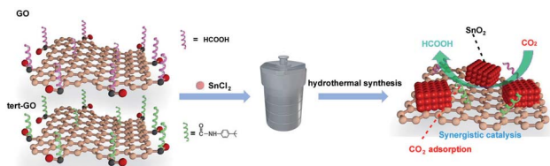
Fig. 1 Synthesis scheme of \text{SnO}_2/\text{GO} and \text{SnO}_2/\text{tert-GO} .

the catalytic conversion of carbon dioxide. Obviously, the chosen supports not only can stabilize the active sites but also provide additional opportunities to enhance the catalytic activity.