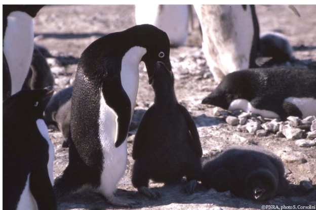
Fig. 2 An Adèle penguin feeding its chick (©PNRA, photo S. Corsolini).

Soil and pond sediment samples have been included in several studies on the POP contamination of the Antarctic regions (e.g. 6,50–52 ), although an analysis of a temporal trend in association with climate change still lacks in the literature for these environments. Only an article reports the correlations between climate parameters and contamination in a terrestrial ecosystem of Livingston Island (West Antarctica). 27 The authors suggested that the remobilization of PCBs is driven by changes in temperature and soil content of organic matter; they suggested that the current and future POP remobilization and sinks