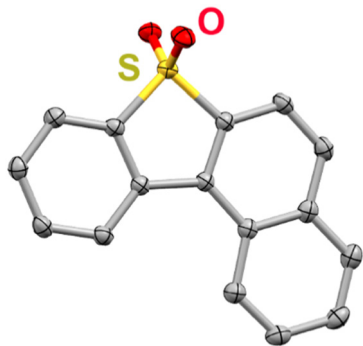
Fig. 2 Molecular structure of BNTD obtained from single-crystal X-ray diffraction studies. Yellow = S, red = O, gray = C; thermal ellipsoids at 50%; H atoms are omitted for clarity. CCDC 2350924.†

in activity should be due primarily to electronic and not steric effects.