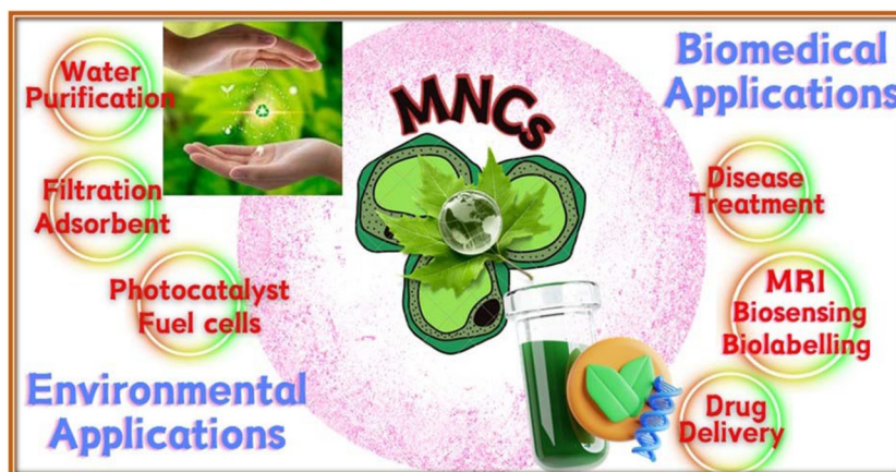
Fig. 3 Schematic presentation showing the various translational applications of magnetic nanocellulose composites (MNCs) in the biomedical and environmental fields.