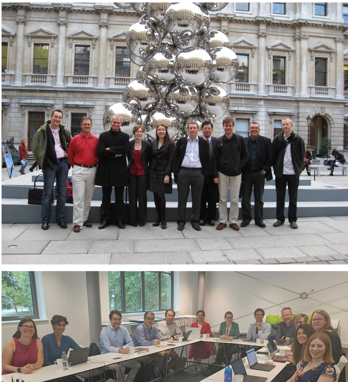
Fig. 1 2009 Polymer Chemistry Editorial Board meeting (top) and 2024 Polymer Chemistry Editorial Board meeting (bottom).

David and Christopher's footsteps and will aim to continue serving the broader polymer community building on the excellent foundations that have been established. As part of serving the community, I aim to work with other chemical societies in building on FAIR principles for the polymer community, as well as addressing global challenges such as sustainability. I look forward to leading Polymer Chemistry and, with our talented Editorial team, inspiring the future generation of scientists" (Fig. 1).