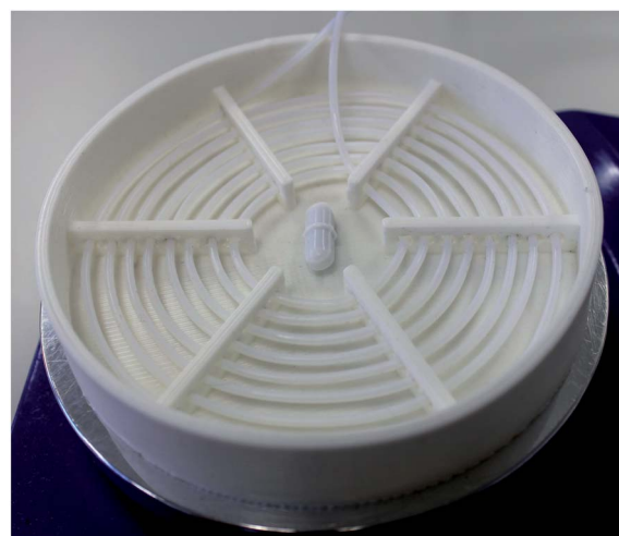
Fig. 3 Photograph of a 3D-printed oil bath with integrated mounting holes for holding PTFE tubing in a fixed spiral arrangement.