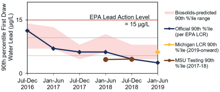
Fig. 2 Comparison in post-federal emergency Flint of 90th percentile first draw lead from official Lead and Copper Rule (LCR) sampling 11 against that predicted by the biosolids model (this paper), independent sampling led by Michigan State University or MSU, 14 and the new Michigan LCR that uses the highest WLLs of either first or fifth draw.<sup>45</sup> The 90th percentile first draw water lead "range" was calculated from the biosolids-predicted WLL<sub>90</sub> using the first-draw-to-second-draw ratio of 1.6 (minimum) to 4.0 (maximum) observed in five water sampling rounds 2015-17.

Lead from other non-plumbing sources (i.e., Pbother) was estimated as 1.41-1.79 kg per month in our prior analysis.<sup>38</sup> We then solved for the remaining variables of lead from service pipes (or, Pb<sub>services</sub>) and indoor plumbing (or, Pb<sub>indoor</sub>)