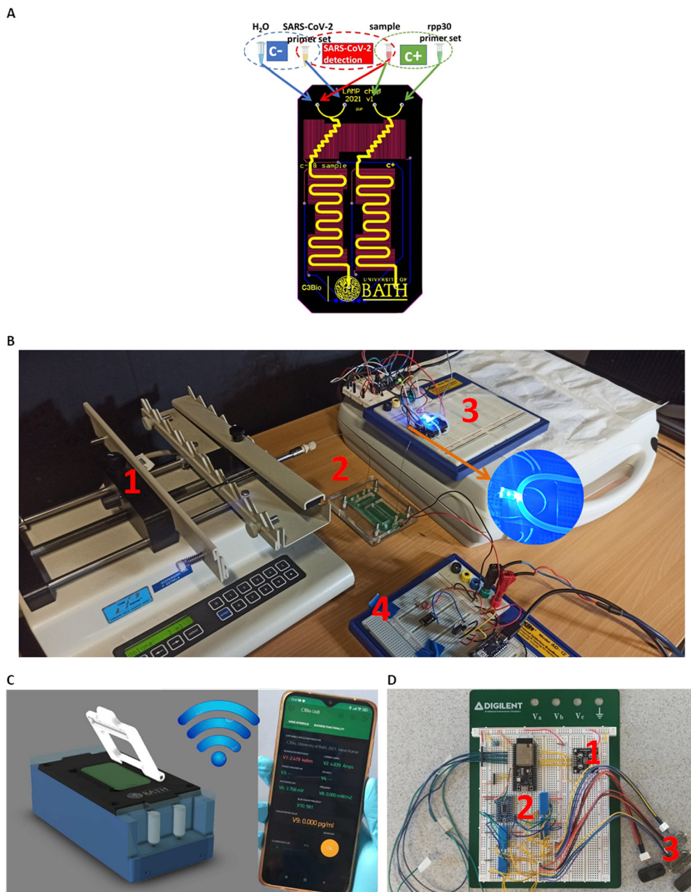
Fig. 1 A) Process schematic of the 3-in-1 SARS-CoV-2 detection platform; input fluidic paths for the negative control (c-) (blue circle), the positive control (c+) (green circle) and the SARS-CoV-2 detection (red circle). The micromixer, the amplification channels and the outlet vias are displayed. Embedded, copper microheaters are displayed in red colour. B) The experimental setup of the ultrafast, real-time quantitative RT-LAMP platform: 1) syringe pump, 2) RT-LAMP on PCB, 3) fluorescence detection and 4) embedded microheaters controller. C) The CAD design of the portable instrumentation which includes all the system parts of the experimental laboratory setup in their compact version. Both the experimental setup and the portable version wirelessly transmit the test results via Wi-Fi to our custom mobile application. D) The prototype breadboard module with the control circuitry of the real-time quantitative RT-LAMP: 1) the optical sensor, 2) the control circuit for the heaters, the micro-pumps and the optical setup and, finally, the 3) Bartels mp6 micro-pumps.

and an essential feature for diagnosis in clinical settings. Therefore, seamlessly integrated SARS-CoV-2 thermal lysis on-chip was also successfully implemented and presented in this paper, using virus-like particles (VLPs) encapsulating specifically designed portions of the SARS-CoV-2 genome as surrogates.