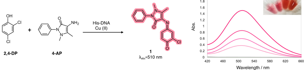
Scheme 1 Colorimetric oxidation reaction between phenolic compound 1 and aromatic amine 2 catalyzed by laccase-mimetic Cu-His-DNAzymes.

dine-rich catalytic domain of laccase (PDB ID: 2X88). A threonine-tethered histidine residue was synthesized as reported previously. 10,11 To construct an active site capable of coordinating multiple copper ions, His-containing phosphoramidites were sequence-specifically installed on oligonucleotides through automated solid-phase DNA synthesis (Scheme 2). His-modified DNAs with palindromic sequences (5'-GGACC-His-His-GGTCC-3') were obtained in high yield (overall synthetic yields ~70%) after the consecutive incorporation of His modules. Together with canonical B-DNA, diverse tertiary DNA structures including a G-quadruplex, a quadruplex-duplex hybrid, and three-way junction (3WJ) DNAs were designed as scaffolds for His functionalization (Table S1†). All oligomers were purified through reverse HPLC and then identified using MALDI-TOF-MS spectroscopy. Circular dichroism (CD) analysis provides structural information on DNA, and we confirmed that the His-functionalized oligomers possessed the desired conformations (Fig. S1†). Besides canonical B-helical structures of duplex-HH and 3WJ-HH, interG4-HH was characterized as an intermolecular parallel G-quadruplex in potassium ion solution. We also observed the antiparallel G-quadruplex of QD-HH in the presence of potassium. To investigate the