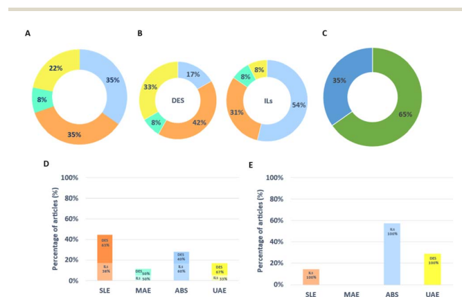
Fig. 2 (A) Distribution of IL/DES-based techniques for the extraction and separation of non-animal proteins and enzymes by (●) conventional SLE, (●) MAE, (●) UAE and (●) ABS. (B) Distribution of DES and IL-based techniques for the extraction and separation of non-animal proteins and enzymes by (●) conventional SLE, (●) MAE, (●) UAE and (●) ABS. (C) Distribution of articles related to extraction and separation of proteins (●) and enzymes (●). (D) Percentage of published articles per extraction and separation technique, using ILs or DES, for proteins. (E) Percentage of published articles per extraction and separation technique, using ILs or DES, for enzymes. Data were obtained from the Web of Knowledge in November 2022.

The described techniques to extract proteins from non-animal biomass, resorting to ILs and DESs as alternative solvents, are discussed in the current review. Fig. 2 shows the status of the literature related to the application of the mentioned IL- and DES-based processes in the extraction and purification of proteins and enzymes from non-animal sources. The techniques most investigated for protein and enzyme extraction and purification are SLE and ABS. These techniques have been mainly applied to proteins, accounting for 65% of the studies, contrasting with 35% of studies dealing with enzymes. In this line, SLE has been mainly applied to proteins, whereas ABSs have been mainly investigated with enzymes.