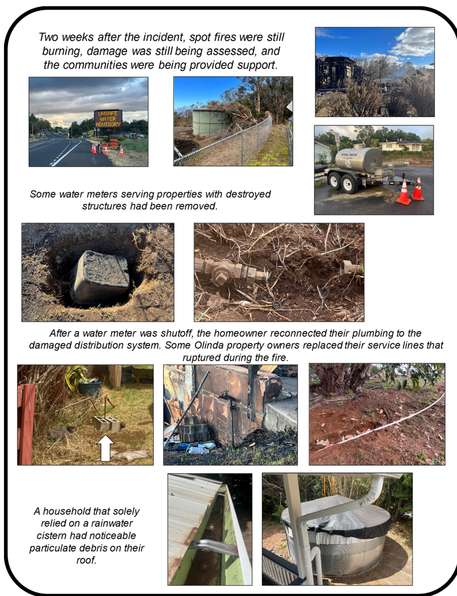
Fig. 2 Two weeks after the wildfire and the evacuation orders had been lifted, some fires were still burning, and various damage and household responses were observed.

The following results reflect our study's bias toward households affected by the Kula Fire: a majority of households that evacuated (7 of 11) either returned to their