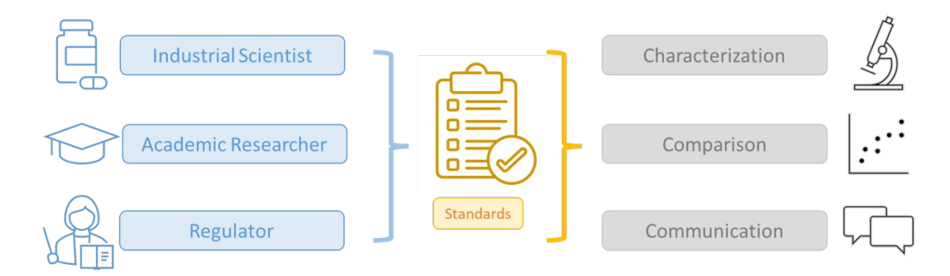
Figure 1. Standards are developed as a result of the work of different collaborating stakeholders. Standards will help in the process of characterization and comparison of microphysiological systems, and communication between stakeholders.