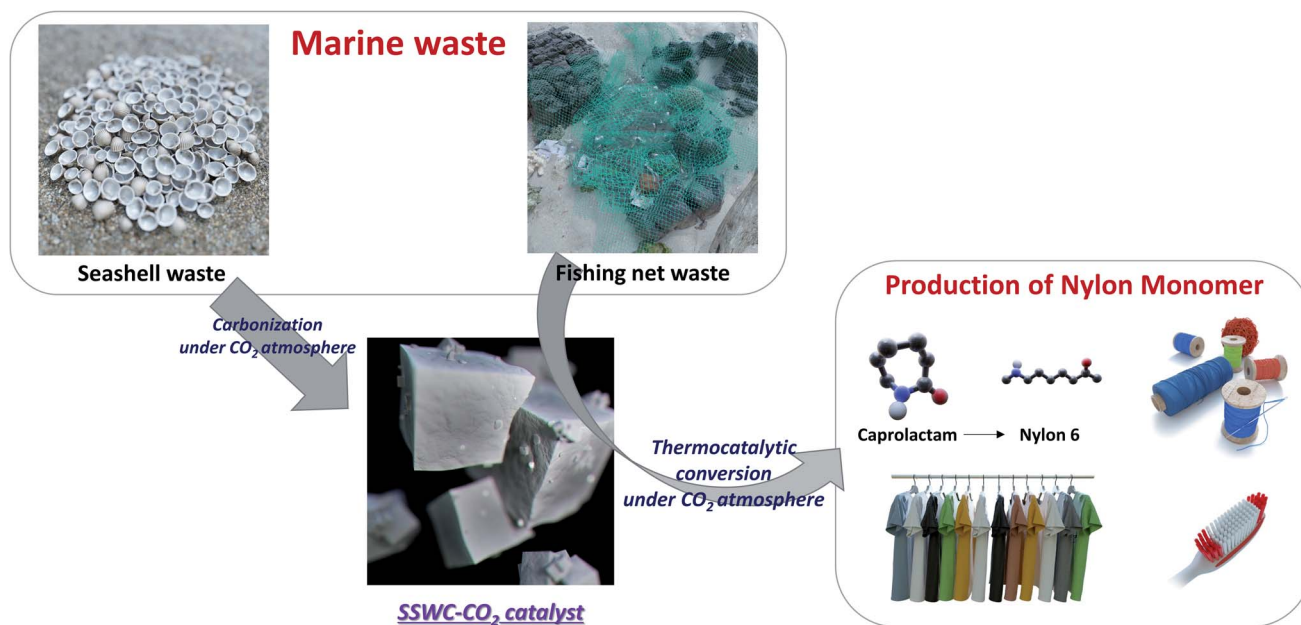
Fig. 1 Conceptual diagram of marine waste upcycling proposed in this study.

The preparation of catalysts from waste materials is another waste-upcycling method. Utilizing waste materials to prepare