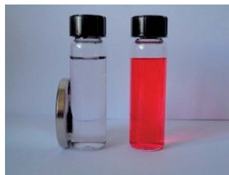
Fig. 8 Photograph of the fuchsin solution ( 20 \text{ mg L}^{-1} , right) and the solution after adsorption with the G/ \text{Fe}_3\text{O}_4 adsorbent for 1 h and separation with a magnet (left). Reproduced with permission from ref. 239.

Chandra et al. 240 used a magnetite reduced graphene oxide (M-RGO) composite for the removal of Arsenic ions and also studied the effect of pH on the adsorption efficiency of the hybrid material. It was observed that the adsorption efficiency is highly dependent on the pH values. The adsorption mechanism involved electrostatic attraction between positively charged