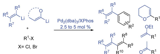
Scheme 1 Palladium catalysed cross-coupling of alkenyllithium reagents.