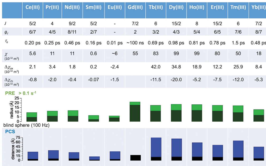
Fig. 2 Typical values of electron relaxation time ( \tau_e ), magnetic susceptibility ( \chi ) and axial and rhombic anisotropy ( \Delta\chi_{ax} and \Delta\chi_{rh} ) of lanthanoid ions. The typical radii of blind spheres (black) and spheres with ^1\text{H} PREs larger than 0.1 \text{ s}^{-1} (green), and the maximum distances of nuclei in axial position with PCSs of 0.05 \text{ ppm} (blue) are also shown for a protein with the reorientation time of 10 \text{ ns} at 700 \text{ MHz} .

at 900 \text{ MHz} , and the radius of the ^1\text{H} blind spheres for the different metal ions. Blind sphere radii are also shown in Fig. 1 and 2 together with the radii of the spheres containing nuclei with R_1 ^1\text{H} PREs larger than 0.1 \text{ s}^{-1} (taken as detection limit).