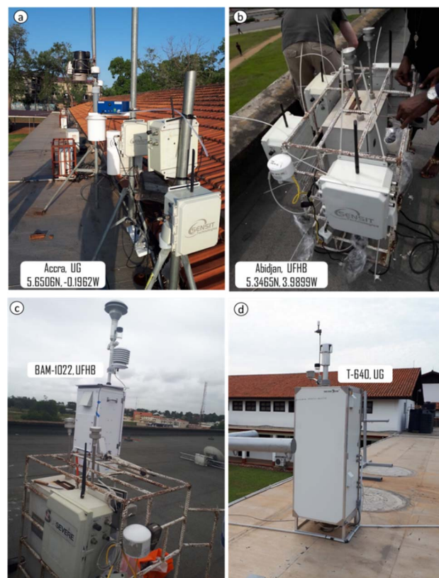
Fig. 2 Pictures of monitors, (a) RAMPs at UFHB, (b) RAMPs at UG, (c) collocation of BAM-1022 and RAMPs at UFHB, (d) Teledyne T-640 at UG.

In Accra, RAMP-1033 and RAMP-1034 were deployed from 10 March 2020 to 31 March 2021 at the atomic interchange (AI) and Kwashieman Trinity Presbyterian Church (KTPC) respectively. These two RAMPs were then later collocated for calibration with