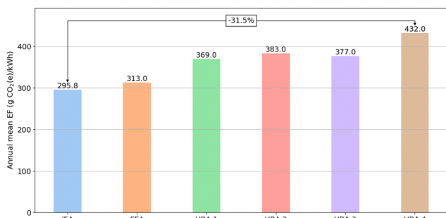
Fig. 2 Annual mean grid emission factor for Germany in 2020, according to different sources (IEA, 6,7 EEA 8 and UBA 9 ). UBA 1–UBA 4 represent four different approaches to calculating a grid EF, varying the aspects impact metric (CO 2 , CO 2 -equivalents), inclusion of electricity trade (with, w/o) and system boundaries (direct, life-cycle emissions). UBA 1: CO 2 , w/o trade, direct emissions; UBA 2: CO 2 , with trade, direct emissions; UBA 3: CO 2 e, w/o trade, direct emissions; UBA 4: CO 2 e, w/o trade, life-cycle emissions.

To address RQ1, we undertake a comprehensive literature review, aiming to pinpoint the methodological decisions that influence grid EF calculations. Section 2.1 presents the results