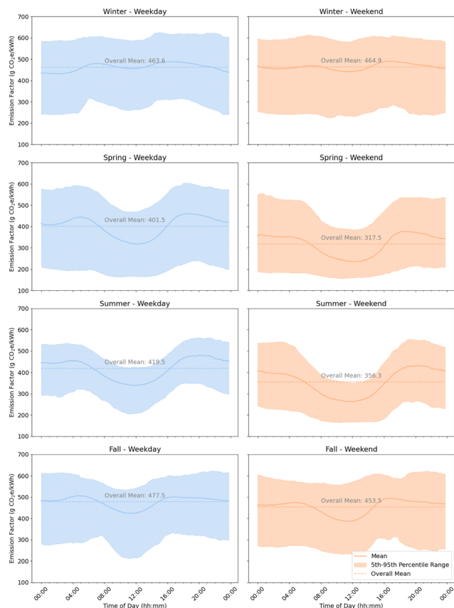
Fig. 8 Grid EF by day type, season, and time of day for the year 2021. The solid line represents the mean value for specific time points (e.g. 12:00 h), day type (e.g. weekday), and season (e.g. Summer). The shaded area delineates the range between the 5th and 95th percentiles of the data, highlighting the distribution's variability and indicating where 90% of the values lie for the given time and year. The dashed line represents the overall mean, i.e., the daily mean for a given day type and season.

and around midday. However, the 'dip' at night becomes less pronounced and is barely detectable for the year 2022.