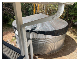
Fig. 2 Two weeks after the wildfire and the evacuation orders had been lifted, some fires were still burning, and various damage and household responses were observed.