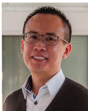
David Y. W. Ng

† Electronic supplementary information (ESI) available. See DOI: https://doi.org/10.1039/d2tb00812b