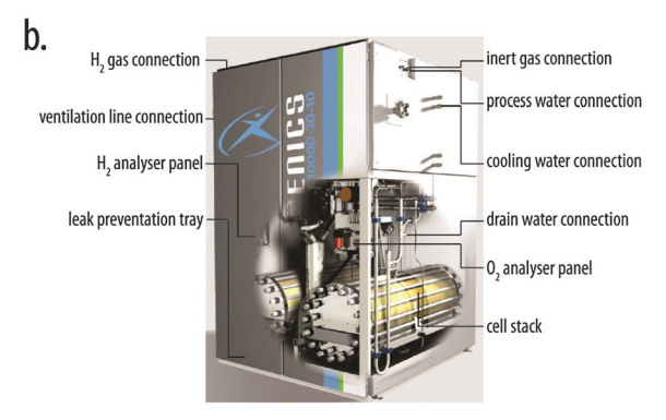
Fig. 1 (a) A schematic illustration of a simple U-tube configuration for water electrolysis. Voltage penalties (overpotentials) increase the total voltage required to operate the system at a given rate relative to the thermodynamically required potential, and include the kinetic overpotentials associated with the hydrogen-evolution and oxygen-evolution reactions (\eta_{\text{HER}} \text{ and } \eta_{\text{OER}}, \text{ respectively}), \text{ the concentration overpotential } (\eta_{\text{con}}), \text{ and } ohmic resistance loss ( \eta_{\text{ohm}} ). The total operating voltage of the system is given by the sum of the thermodynamic voltage for the water-splitting reaction and the total overpotential, \eta_{\text{total}} , for the system. (b) A schematic illustration of a commercially available (Hydrogenics) alkaline water electrolyzer with auxiliary components.7

transfer between most metal electrodes and a species in solution are slow for complex, multi-step electrochemical reactions, including reactions as simple as the two-electron reduction of two protons to form a single molecule of H<sub>2</sub>. <sup>12,13</sup> The overpotential partially overcomes the activation barrier for such processes, with the exact partitioning of the potential between the liquid and the kinetic barrier depending on the details of the system. Assuming an Arrhenius-type relationship for the interfacial charge-transfer kinetics yields an exponential relationship between the overpotential and the rate, or current density, j, of the reaction of interest: