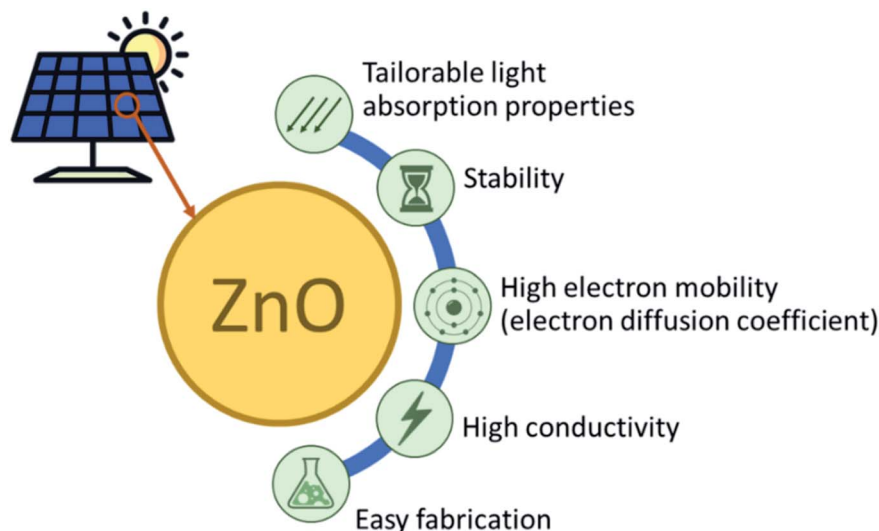
Fig. 1 The merits of ZnO for solar cell application.

have made ZnO widely applied in many areas, such as sensors, surface coating, porous ceramics, photodetectors, nanopiezoelectric, and supercapacitors, in addition to solar cells. There are also many available methods to prepare ZnO nano-materials from different pathways (biological/physical/chemical), such as green synthesis using microorganisms, hydrothermal, sol-gel, electrochemistry, inkjet printing, atomic layer deposition, and sputtering technique.