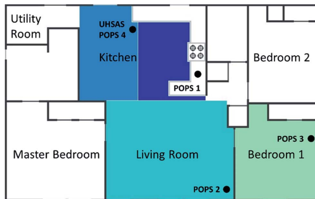
Fig. 1 Floor plan of the UTest house. Black dots and labels indicate instrument sampling positions. Colors for the different zones on this plot indicate how the data in this paper will be organized, with the darkest color being the measurement closest to the source (kitchen) and the lightest color being the furthest from the sources (bedroom 1). The kitchen is considered a single zone in this analysis but has two colors to represent the two different instruments and sampling points within the zone.

The HOMEChem campaign took place from 1 to 30 June 2018. 31 HOMEChem included a comprehensive suite of chemical and physical measurements that monitored both particle and gas-phase species during cooking, cleaning, and occupancy activities. The campaign utilized the UTest house at the University of Texas at Austin (Austin, TX, USA); a 3-bedroom, 2-bath house with a total house volume of 250 m 3 and a total floor area of 111